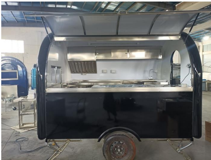
Eatonmore new Bespoke Unit

Please see below photos of the Unit and location.