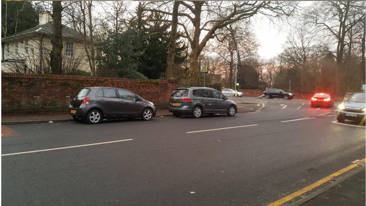
Photos above taken at 6.30am and 8.15am on Thursday 6 th January 2022